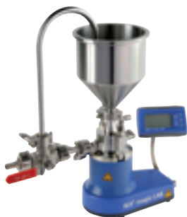
magic LAB® with module Micro-Plant 1 ltr for recirculation process in the open vessel