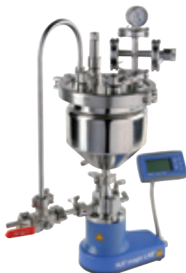
magic LAB® with module Micro-Plant 2 ltr for recirculation process in the closed vessel