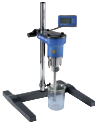
magic LAB® for batch process as ULTRA-TURRAX®