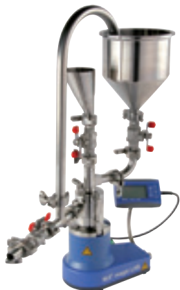
magic LAB® with module CMS and accessories for powder incorporation into liquid in recirculation mode